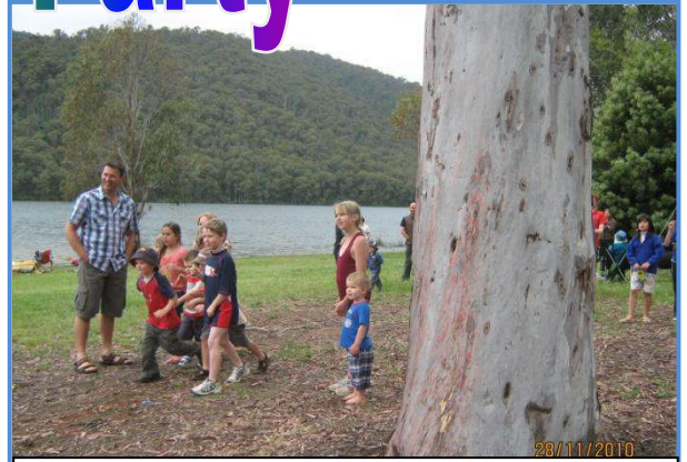
Little kids trying desperately to catch a glimpse of Santa – he's just so busy at this time of year...