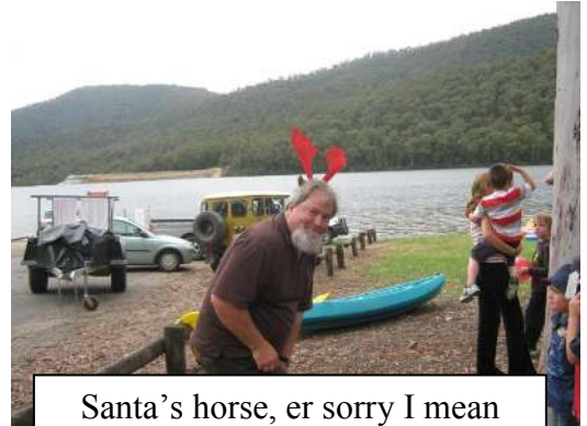
Santa's horse, er sorry I mean reindeer