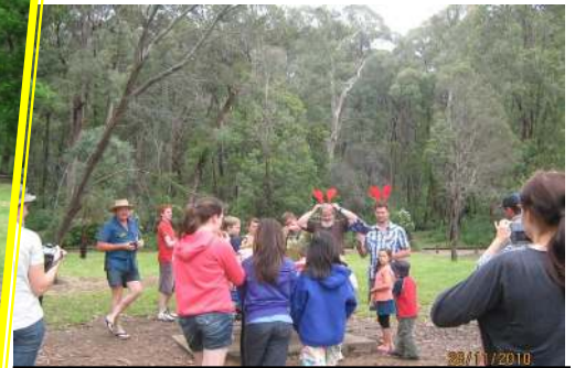
Handing out the presents Present time