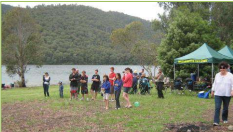
Bigger kids waiting for Santa