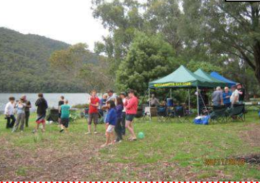
Perfect day for a picnic