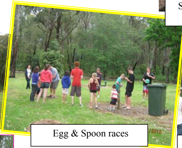
Egg & Spoon races