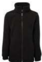
Black or Bottle green, Full Zip Polar (code 3FJ) (code PF631) Ladies