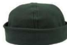
(code CH27) Beanies

PLEASE ORDER AND PAY DIRECTLY WITH WORKLOCKER.