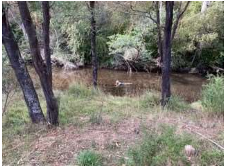
The “Wonnangatta Mermaid”