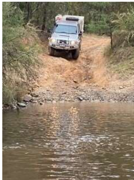
The Wallace's least favourite water crossing