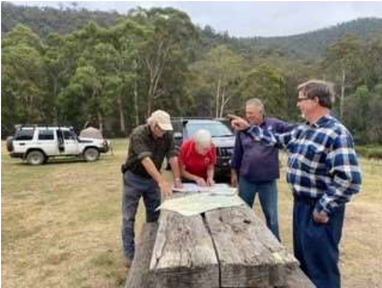
What happens when the “Group” gets together to discuss routes – all going every which-way A variety of opinions.